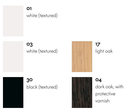
Table tops (Bistro)