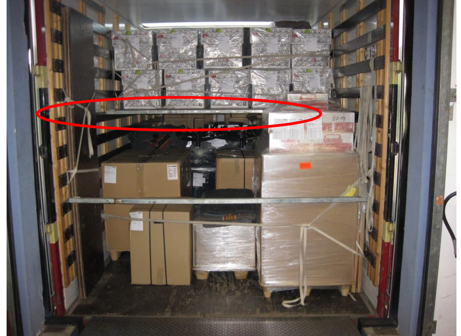
Alternatively use intermediate flooring units