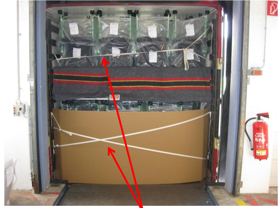
Alternatively use straps every 3-4 meters