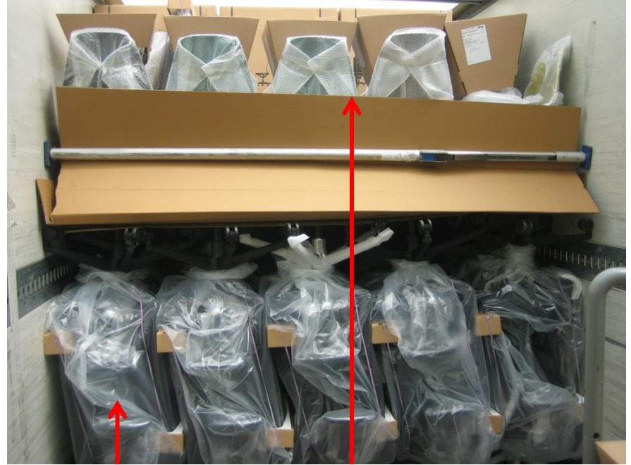
Swivel chairs at the bottom, Standard chairs on top