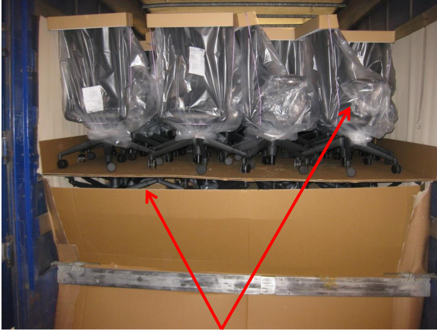
Swivel chairs stacked at the bottom, single ones on top