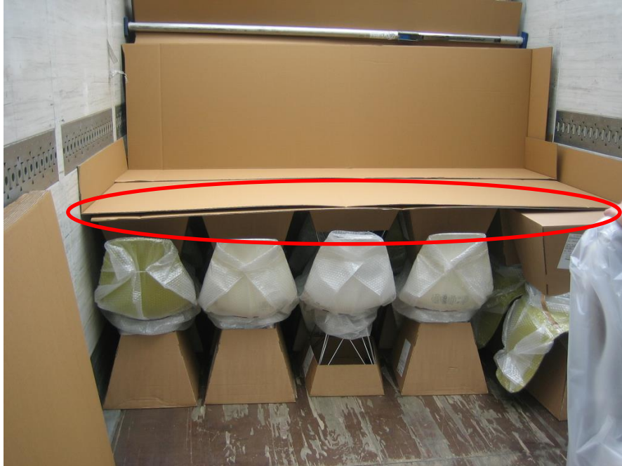
Cardboard as protection Cardboard as intermediate floor (2nd stacking level)