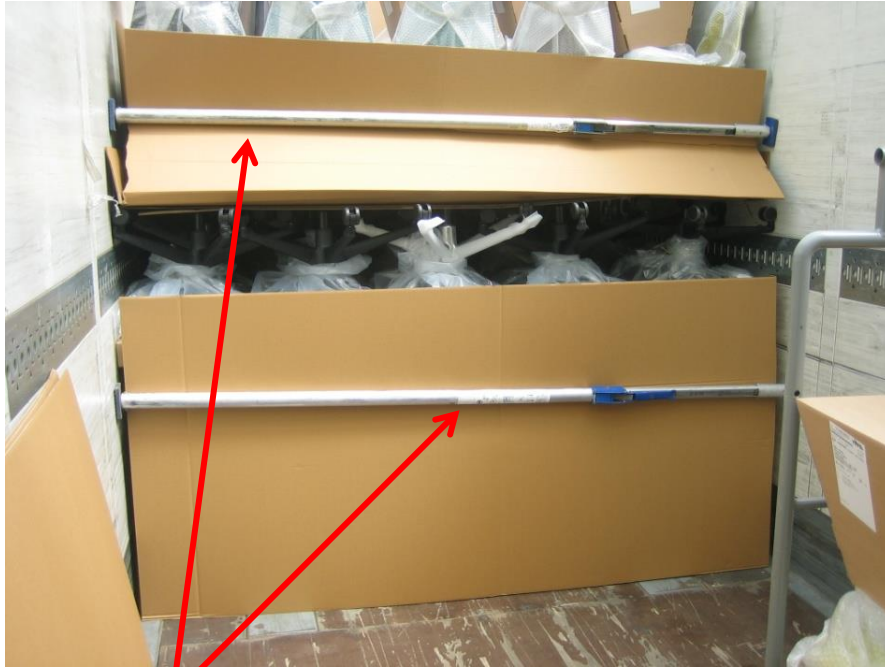
6-8 rods per trailer