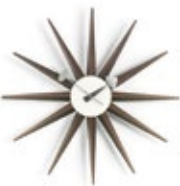
Sunburst Clock, walnut, Ø 18 1/2"