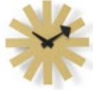
Asterisk Clock, brass, Ø 9 7/8"