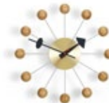
Ball Clock, cherry, Ø 13"