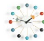
Ball Clock, multicolored, Ø 13"