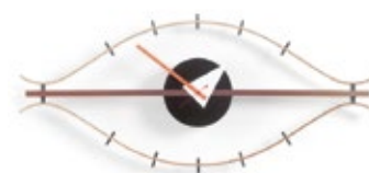
Eye Clock, brass/walnut, H 13 3/8" x W 29 7/8"