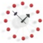
Ball Clock, red, Ø 13"