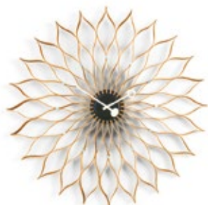
Sunflower Clock, birch, Ø 29 1/2"