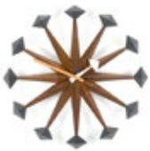
Polygon Clock, walnut, Ø 16 7/8"