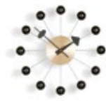
Ball Clock, black/brass, Ø 13"