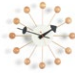
Ball Clock, beech, Ø 13"