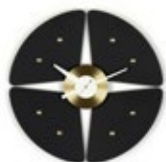
Petal Clock, black/brass, Ø 17 5/8"