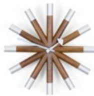
Wheel Clock, walnut/aluminum, Ø 17 7/8"