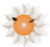
Diamond Markers Clock, white, Ø 335