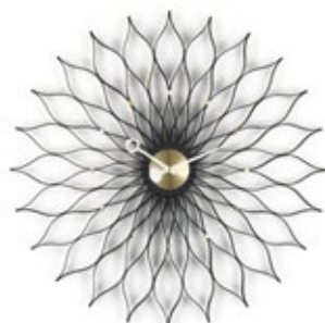
Sunflower Clock, black ash/brass, Ø 29 1/2"