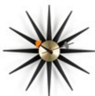
Sunburst Clock, black/brass, Ø 18 1/2"