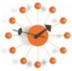
Ball Clock, orange, Ø 13"