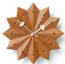
Fan Clock, cherry (USA), Ø 384