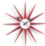
Sunburst Clock, red, Ø 18 1/2"