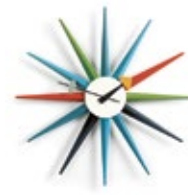
Sunburst Clock, multicolored, Ø 18 1/2"